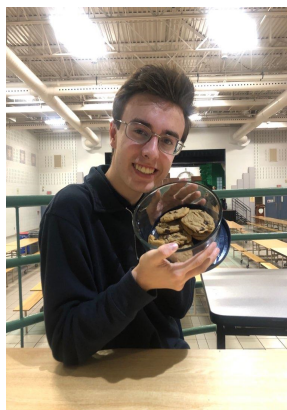
Student holding jar of cookies

Paul Dwyer's Student Council celebrated Halloween with a week of fun Halloween activities. Kicking it off with a bake sale that included lots of spooky treats and some minute to win it games! Finishing the Halloween week, the council hosted a costume contest for all students.