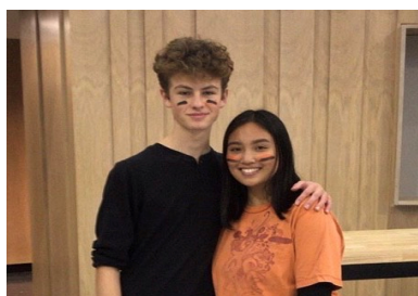
Students posing for a photo

As spooky season approached the All Saints Student Council, they organized and facilitated a fun-filled Halloween week for the student body. The week consisted of a pumpkin carving contest, costumes and much more! The council is also in the works of planning a Rivalry week against their neighbouring school, Father Leo J. Austin CSS.