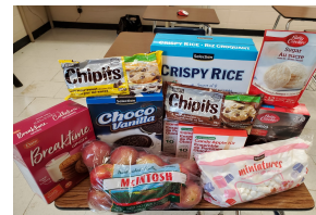
Ingredients for baked goods

The DOC Student Council hosted a Halloween bake sale for the student body. Each council member baked a different delicious treat in order to raise money for their Halloween movie night which features a scary movie and lots of spooky snacks.