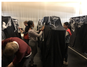
Students decorating a haunted house

It has been three weeks since Pereyma's Student Council began working on their annual haunted house. The council has come a far way, turning an idea into a reality, as they had a successful opening night. The Pereyma Student council cannot wait to start brand new projects for this school year!