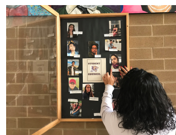
Student pinning photos on board

This month Notre Dame updated their Student Council Board to show new and existing members. This is so the ND Student Body will know exactly who to go to when they need help. The council planned and ran a successful Halloween week, and are now planning their Homecoming.